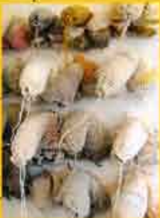
This exhibit gives new meaning to the term well hung.

48 THE PERCENTAGE OF COLLEGE GRADS WHO PLANNED ON LIVING WITH MOM AND DAD AFTER GRADUATION IN 2007 SOURCE: MONSTERTRAK SURVEY