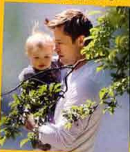
We're gaga for Brad's father-daughter bonding.