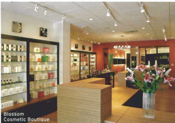
Blossom Cosmetic Boutique

Sephora , King of Prussia Mall, 610-265-8888; sephora.com